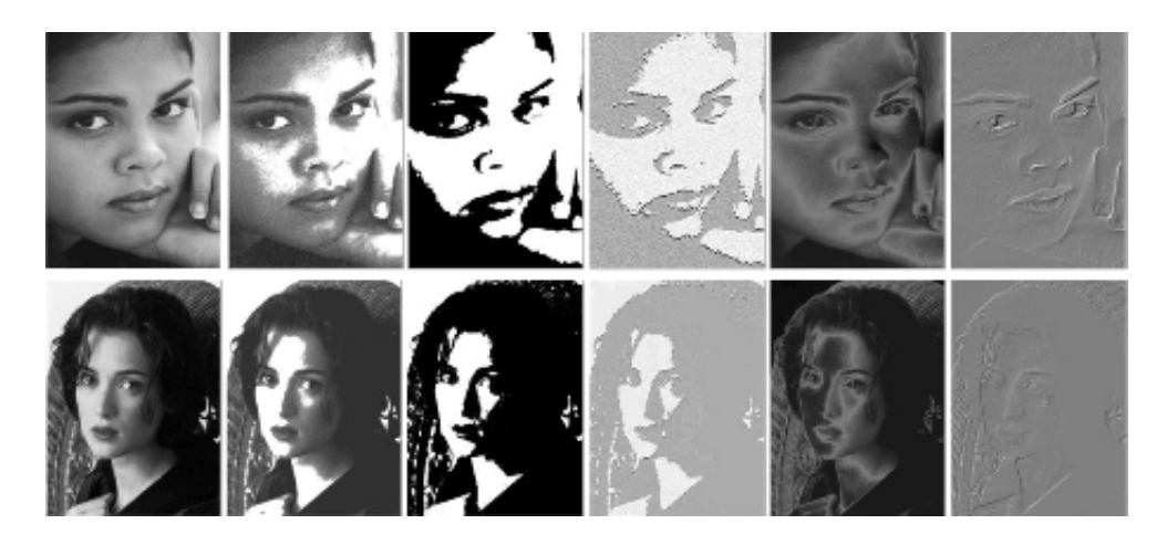
FIGURE 3. Various artistic stylization results for two target images

4. Conclusions. This paper presents an image artistic style learning method based on TBVQ. The proposed method is fast and effective. Future work will concentrate on the improvement of TBVQ to achieve better visual effects and extend the application for color image artistic style learning.